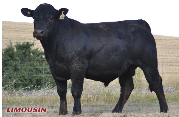
Lot 34 Maryvale Proactive P846