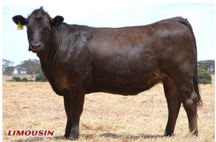
Lot 60 MARYVALE PEBBLE P885