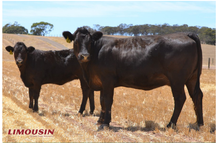
Lot 56 MARYVALE NEWELL N756