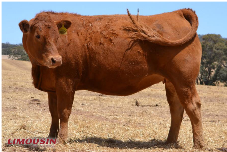
Lot 57 MARYVALE PARADISE P836