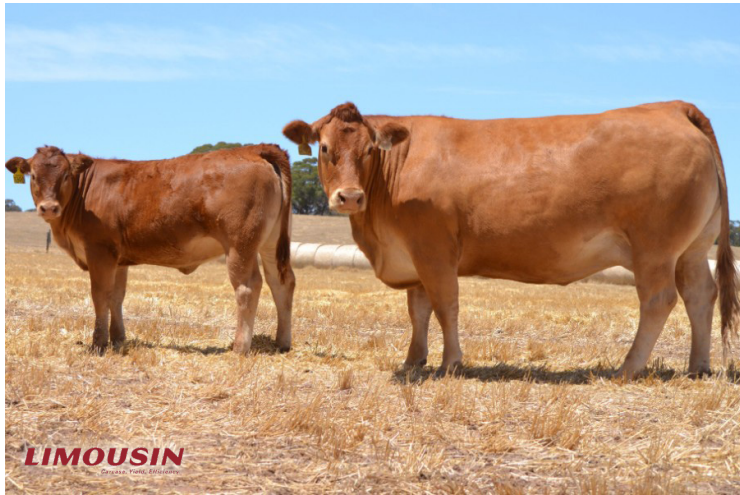
Lot 55 MARYVALE HUTTON H256