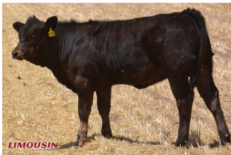
Lot 54 MARYVALE QUANTAL Q968