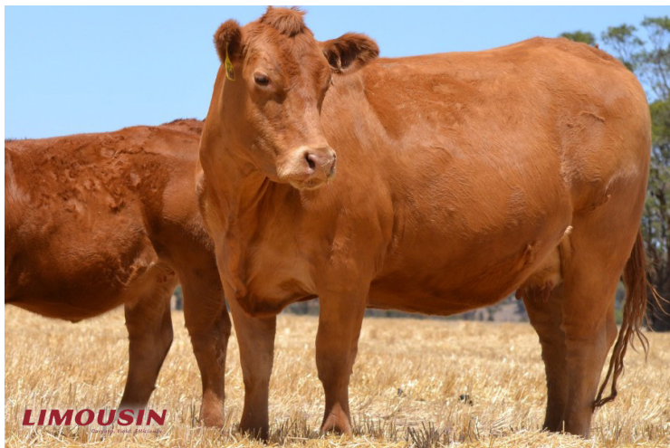
Lot 51 MARYVALE NANCY N781