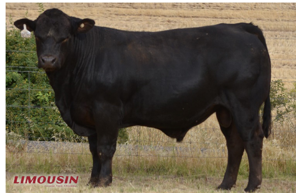
Lot 41 Maryvale Profit P828