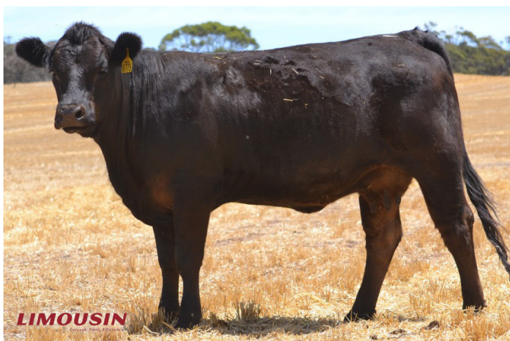
Lot 53 MARYVALE NEWAGE N775