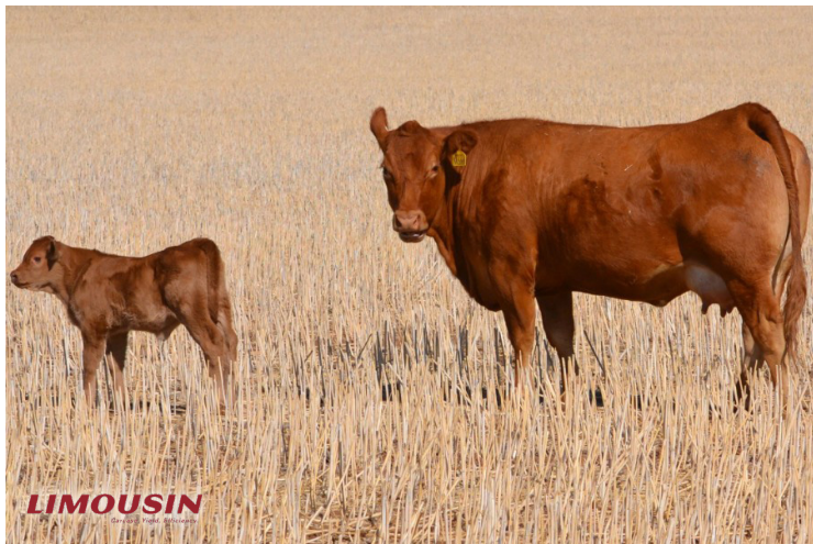
Lot 49 MARYVALE MAGICAL M666