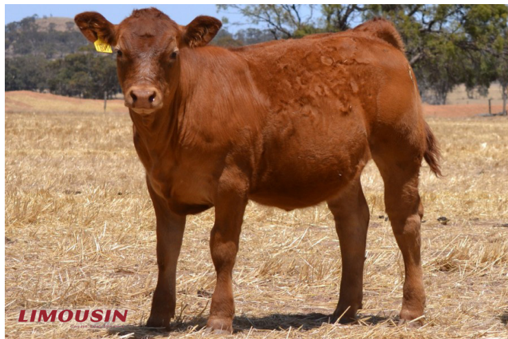
Lot 52 MARYVALE QUINCY Q976