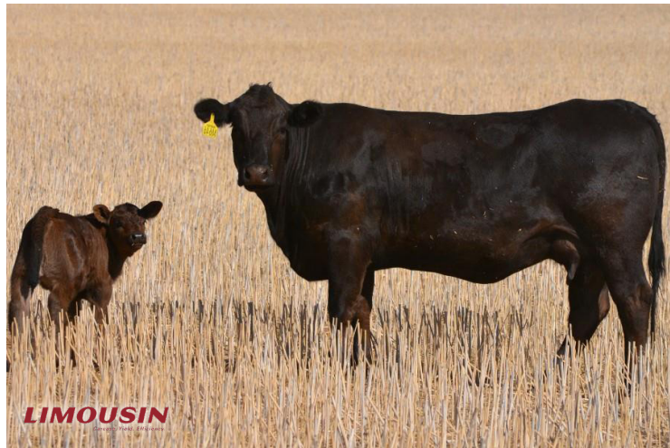
Lot 50 MARYVALE MIDNIGHT M646