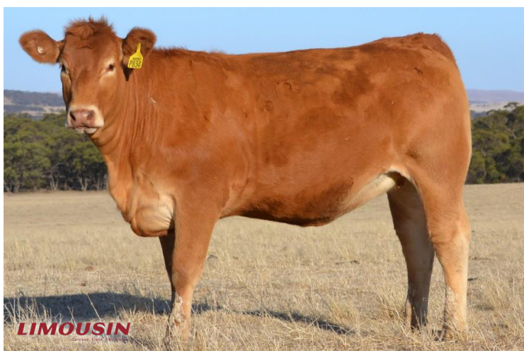
Lot 59 MARYVALE PRINCESS P834