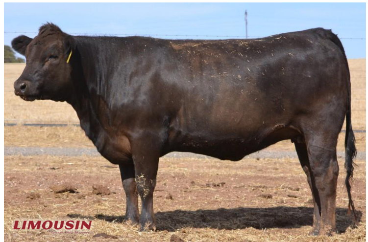
Lot 58 MARYVALE PARADE P807